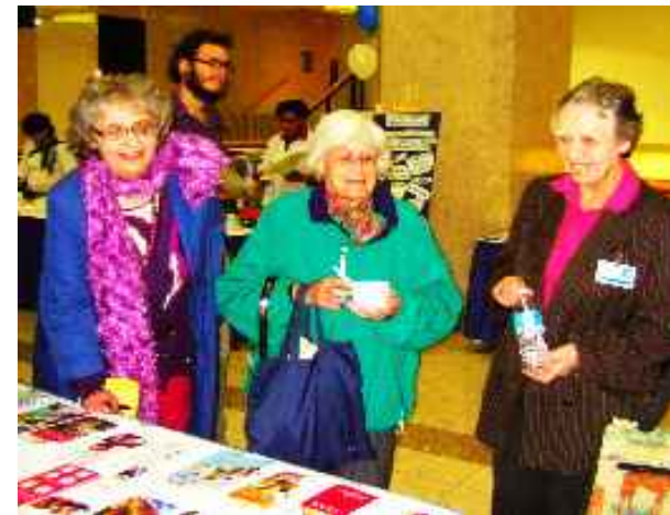
Fair attendees at Sunnybrook's Health Information table.